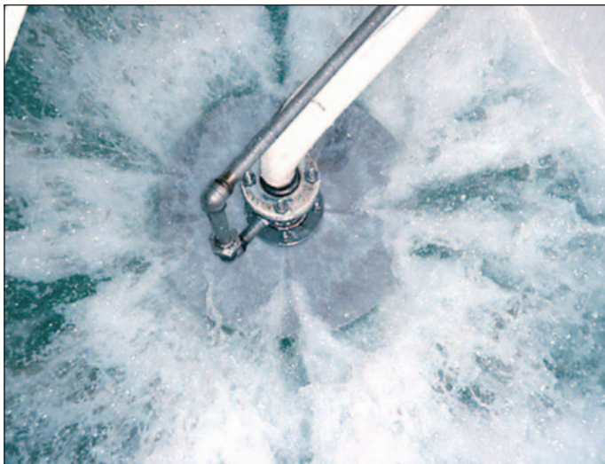
The introduction of a radial eductor (above) resulted in much better gas distribution in the separator (below)