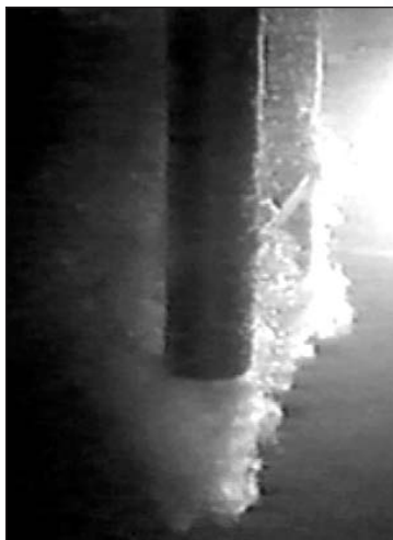
In the original design, air entering the vessel was not well distributed, as illustrated by the photograph and CFD simulation

A number of design variations for the vessel and eductor were subsequently studied using FLUENT. Based on the results, NATCO engineers developed a new eductor design with a radially-directed discharge that offers performance far superior to conventional